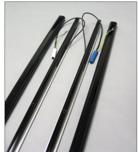
The new Gatekeeper 110 VAC power supply and interface box is compatible with both 79 and 159 beam Gatekeepers.