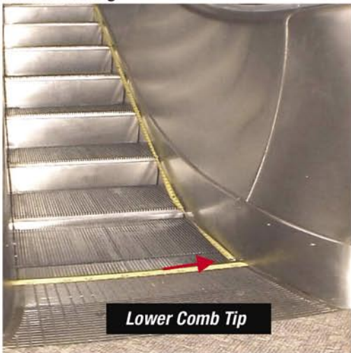
Lower Comb Tip