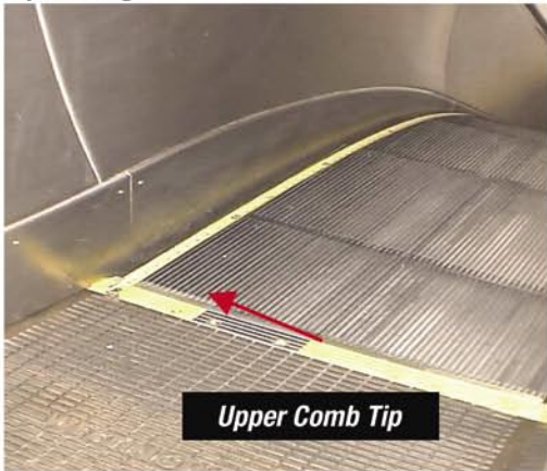
Upper Comb Tip